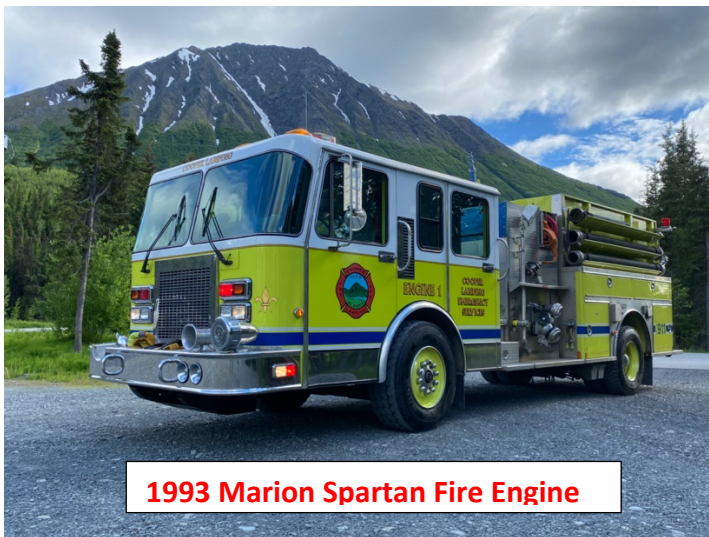
1993 Marion Spartan Fire Engine