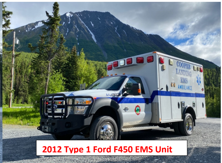
2012 Type 1 Ford F450 EMS Unit